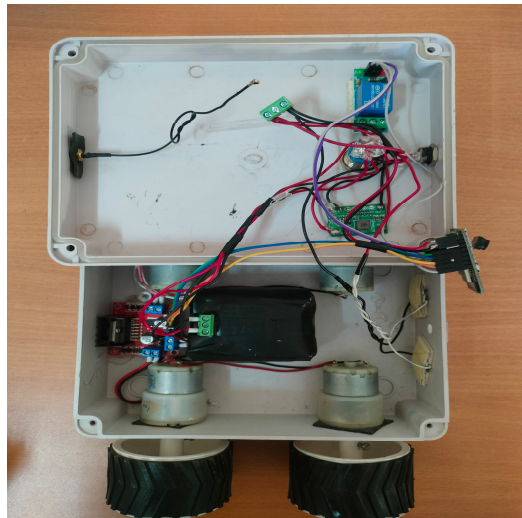
Fig. 1 Fabricated Model

Stability is paramount in the design of the Sewer Inspection Robot, especially considering the challenging environment of Sewer pipelines. The four-wheeled rover configuration, coupled with a sturdy chassis design, enhances the robot's stability, minimizing the risk of tipping or getting stuck during operation.