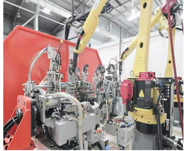
Spot Welding Set-up for BIW of a car