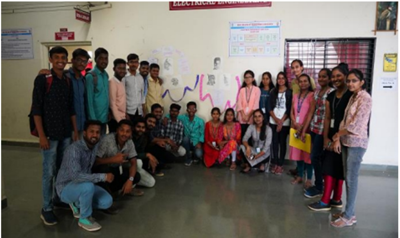
पांचजन्य Magazine Program