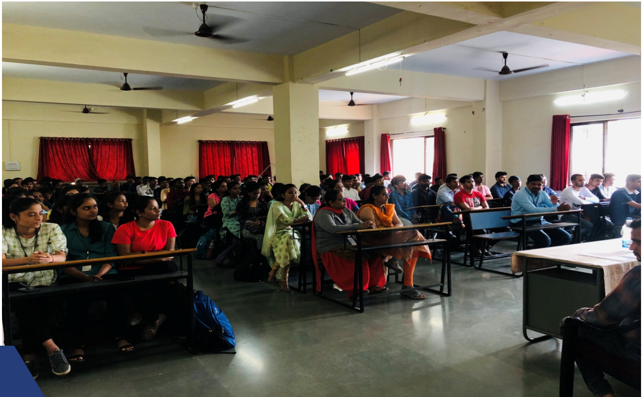
Global Certification Program