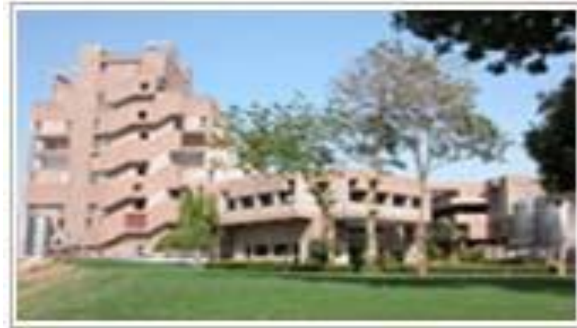
AMUL-Plant in Anand.